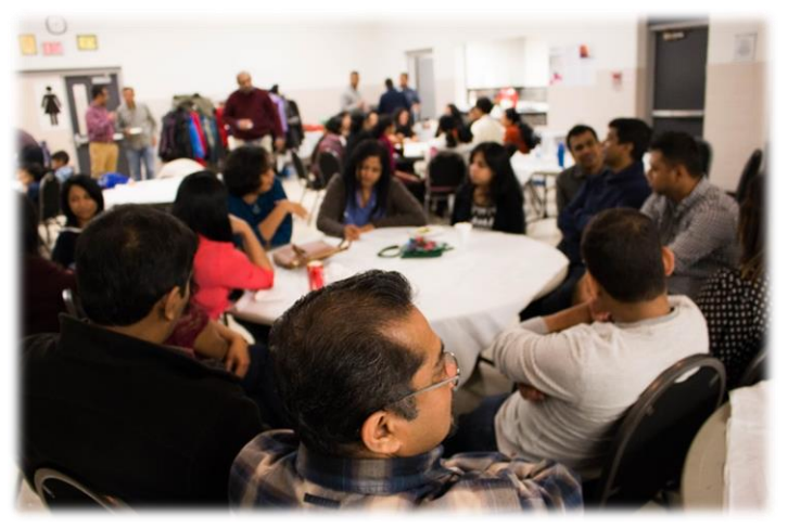
Group Discussion Stage