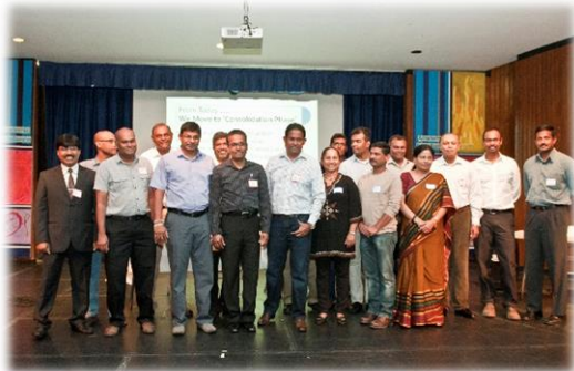
New Board of Management