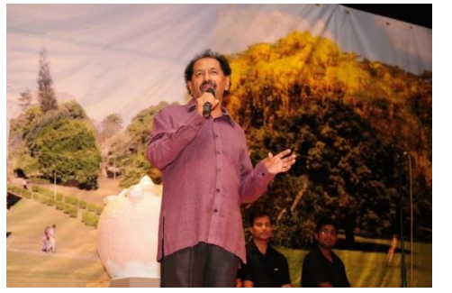
Back to Hantana 2016